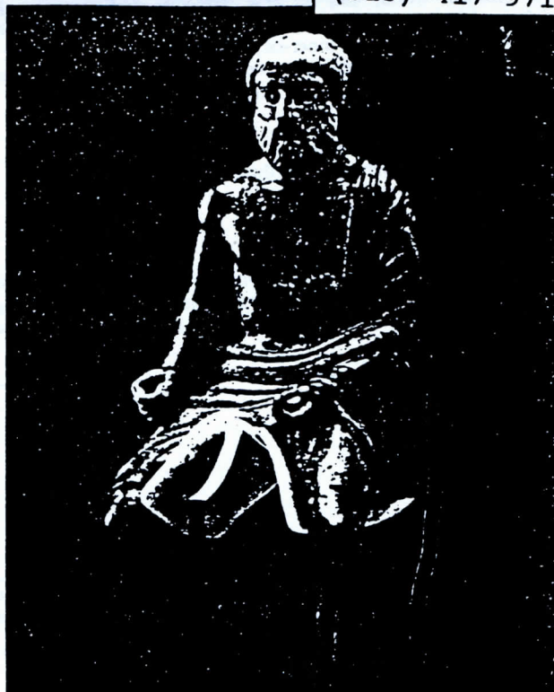
"Bronze Statuette of a Rider," Etruscan, 5th century B.C.